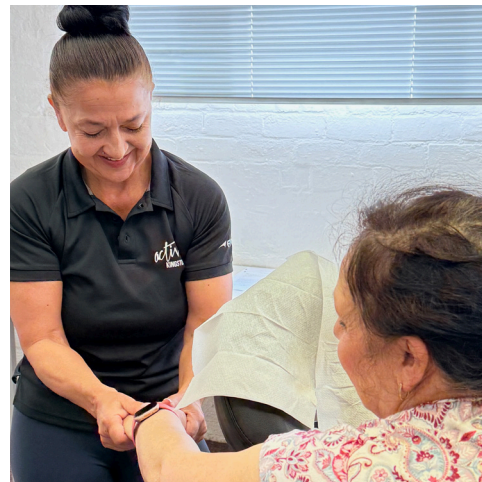
Some well deserved pampering at Carers Massages