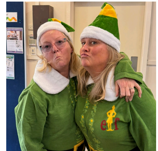
A little mischief from the naughty elves at Mahjong Christmas Party