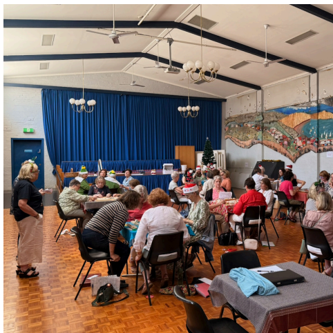
A Great Game of Mahjong at Sandybeach