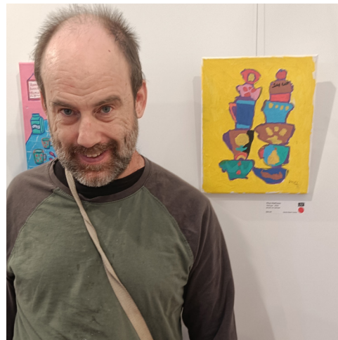
Art by Reece