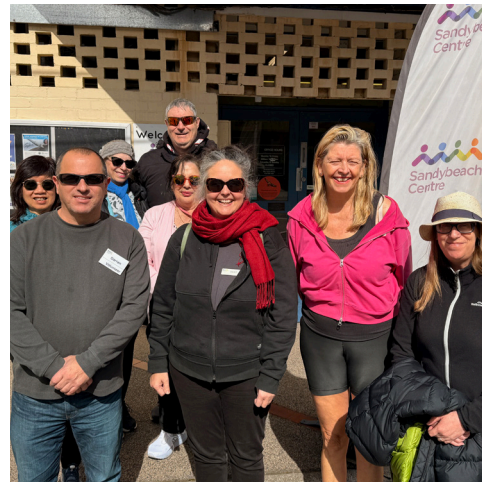
Stepping Out with Our Sandybeach Carers Group