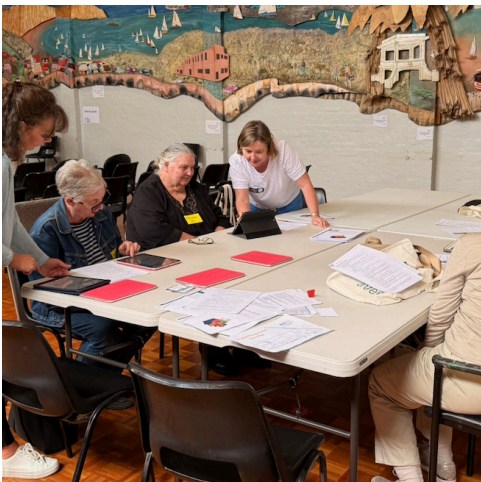
Exploring iPad apps together at our Be Connected Get Online event