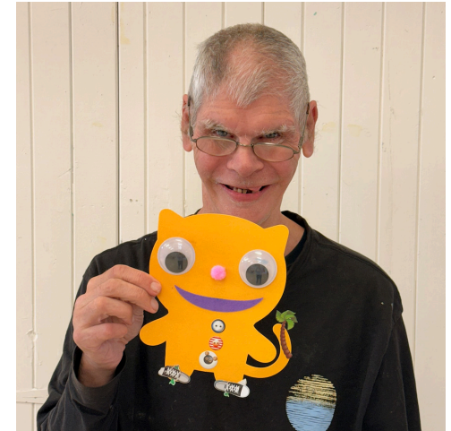
Art by Trevor