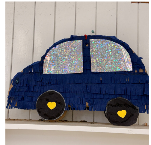
Art by Trevor