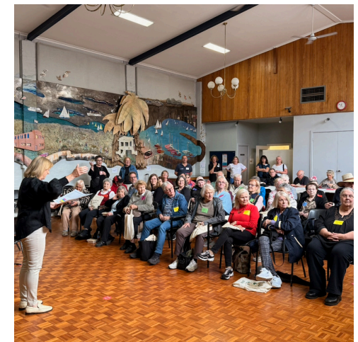
Learning and Connecting at our BeConnected Event