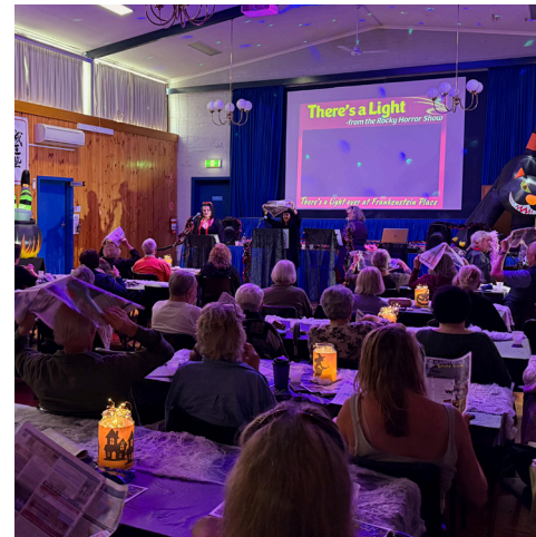
Spooky Tunes at Sandybeach Halloween Live Music