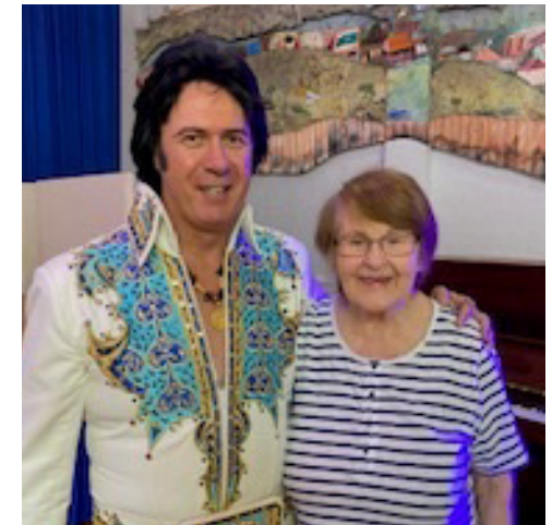
Celebrating the Music of Elvis