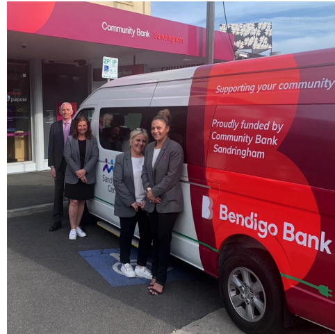
Community Bank Sandringham supporting us with our new EV Bus